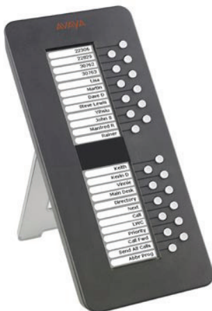
24 Button Expansion Module