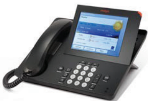
9670G IP Telephone