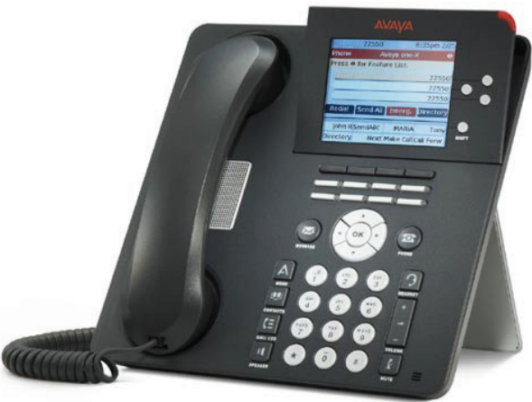
9650 IP Telephone