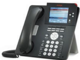
9650C IP Telephone