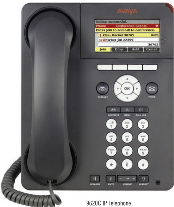
9620C IP Telephone

With the evolution of today's smart phones, PDAs, user interface design has made great leaps forward. Avaya's 9600 Series of IP Telephones have a clear and elegant interface. High resolution graphical displays make it easier to read contextual menus, prompts and instructions – anticipating your intentions and needs. Critical functions like call transfer, conferencing and forwarding are easy for beginner or veteran alike. Softkeys right on the display itself, along with scrolling menus, guide you through every process. Even third-party applications such as company-wide corporate directories can be invoked and used easily. The user interface is consistent across the entire