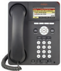
9620C IP Telephone