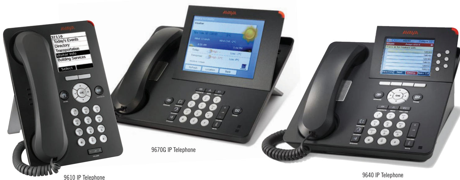
9610 IP Telephone

For the Navigator: the 9650 and Button Module. The Navigator also spends a great deal of time on the phone, largely handling calls for others. Receptionists and executive assistants are examples of Navigators. The 9650 provides one touch access to a great