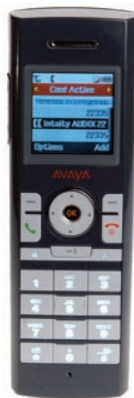
3631 Wireless IP Telephone

range of features and functions; it comes with an integrated button expansion module for quick access to features and people and super efficiency.